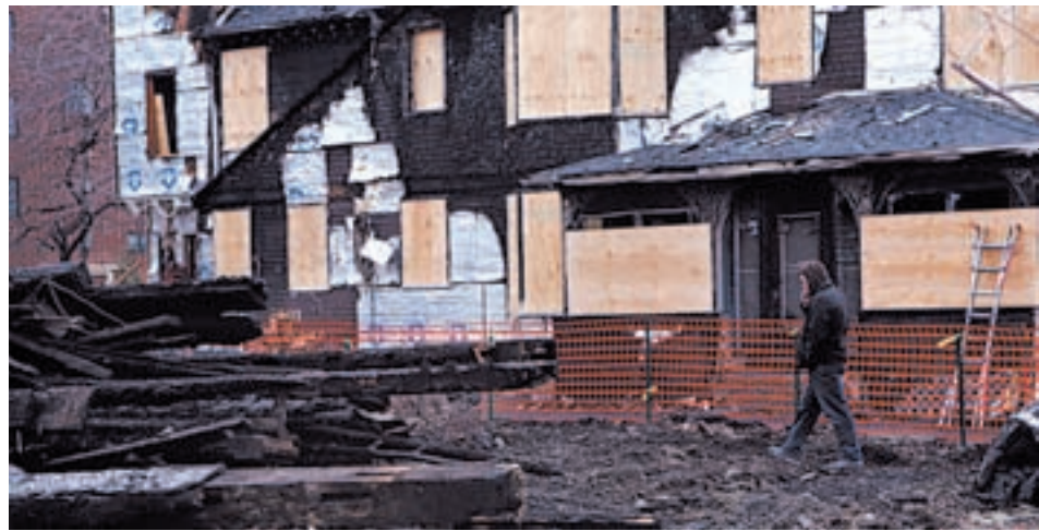
A man walks through the remains of a vacant three-story house on Sewell Avenue in Brookline which collapsed after being ravaged by a four-alarm fire early yesterday morning.

The Tap Project began last year only in New York City, where roughly 300 area restaurants raised $100,000. Over 2,000 restaurants in 16 cities have signed up nationwide this year and Jones said more than $1 million should be raised. That's 40 million liters of clean, safe water. "It really does go a long way and it doesn't take a lot," Jones said. "You just go, eat in a restaurant and give a dollar." The event ends Saturday, which will be marked as the 16th annual World Water Day.